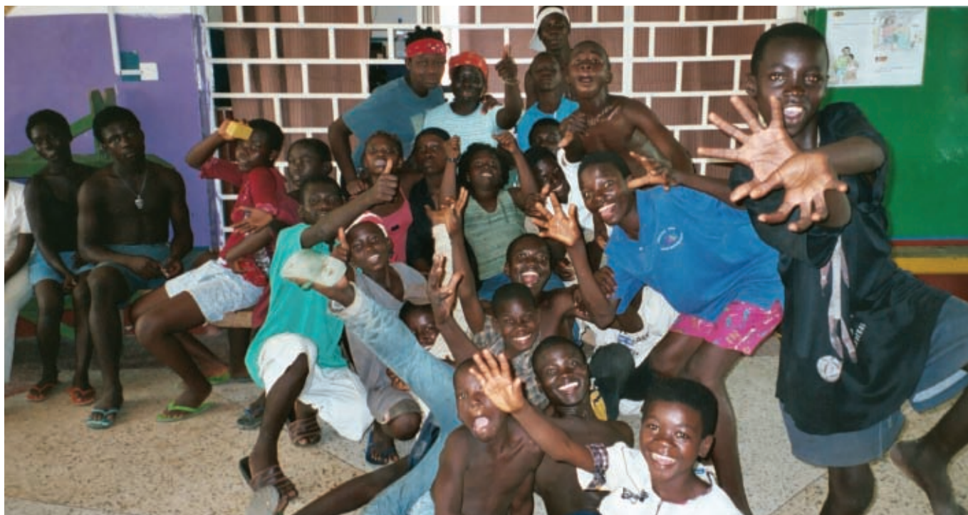
Street Children at The CAS House of Refuge in Lartebiokorshie, Accra, Ghana