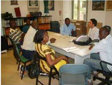
drama training 2010

Some children on sponsorship will be supported with logistics and Ricerca will also organize some additional training program for some members of staff.